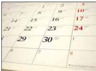
Calendar Page 3