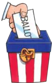
Voter Service Report Page 3